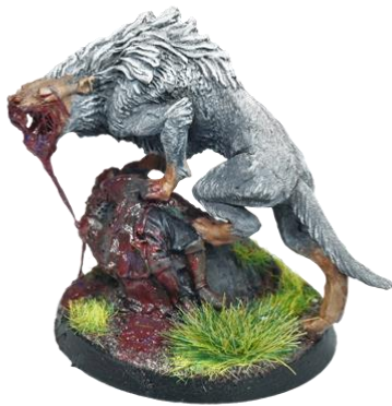
Custom blood goop

3D Printing: I can 3D print models on demand, please email for more information