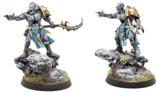
Smaller mountainous base