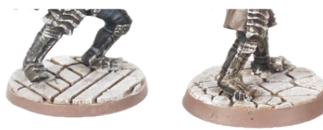
3D printed bases