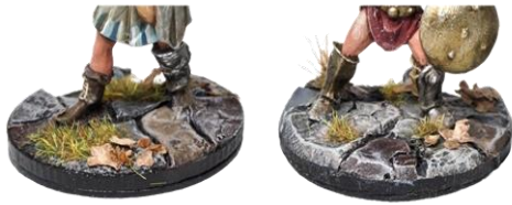
Hand sculpted cobble street bases