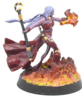
Custom basing flames