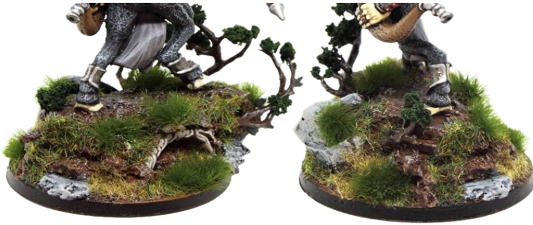
Extra large mountainous base